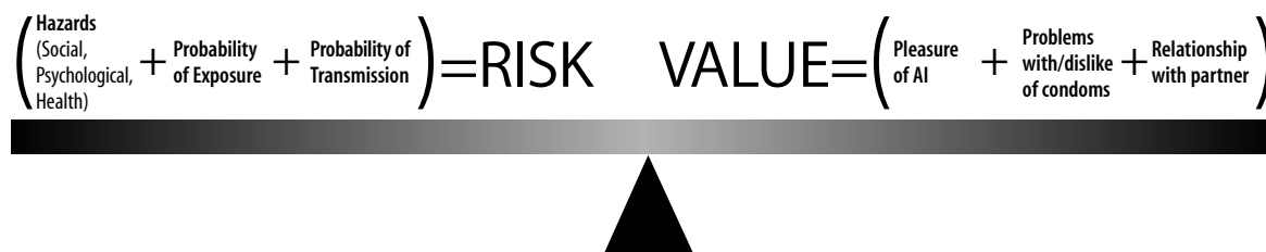
Figure 6.1: Factors influencing decisions to engage in UAI.

The magnitude of risk associated with UAI will depend on: the perceived threat to one's social stability or psychological and physical health; how likely it is that one's partner will be exposed to HIV and if so; the likelihood that he will become infected as a result. On the other hand, the value of UAI is influenced by how pleasurable anal intercourse is to both partners, whether or not either of them experiences difficulties using condoms or simply dislikes them as well as the relationship between both partners. For example, for some men, anal intercourse with a long term beloved partner is particularly valuable while for others anonymous anal intercourse is experienced as particularly exciting.